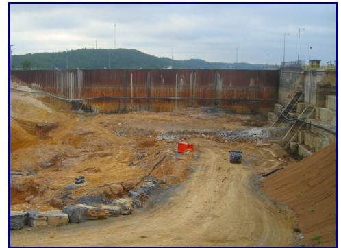
Excavation for new lock construction at Kentucky Lock

the lowermost lock on the Tennessee River and is the gateway for the 12 locks located upstream on the Tennessee and Cumberland Rivers. Annual tonnage passing through the existing Kentucky Lock has ranged