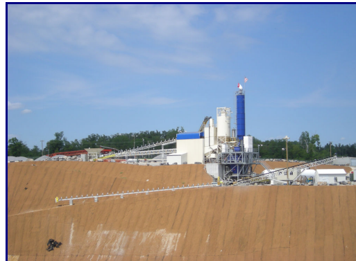
Cement Batch Plant that could be decommissioned without additional funding for Kentucky Lock

ful in securing funding from the American Recovery and Reinvestment Act of 2009 (ARRA) and began excavation in 2010. Through efficient planning and use of scarce funds by the Nashville Dis-