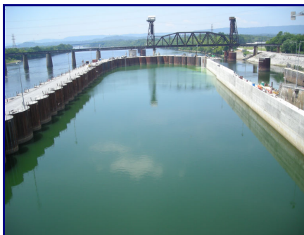
Completed Cofferdam at the Chickamauga Lock Project Site that will be pumped dry in the coming weeks. At that time construction is scheduled to be suspended for what could be as much as a decade without a resolution of the insolvency of the IWTF.

U.S. Senator Lamar Alexander of Tennessee and U.S. Representative Lincoln Davis of Tennessee have requested $28 million be included in the FY 2011 Budget to begin lock construction on the project that is critical to our entire region.