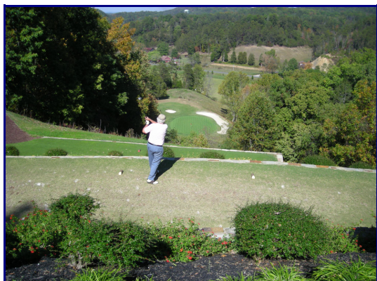
Hole #12 on the Gatlinburg Municipal Golf Course, the site of the TRVA 44th Annual Meeting's Golf Outing on Oct. 18, 2010. "Sky High" plays 194 yards from 200 feet above the green.