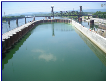
Completed Cofferdam at the Chickamauga Lock Project Site that will be pumped dry in the coming weeks. At that time construction is scheduled to be suspended for what could be as much as a decade without a resolution of the insolvency of the IWTF.

U.S. Senator Lamar Alexander of Tennessee and U.S. Representative Lincoln Davis of Tennessee have requested $28 million be included in the FY 2011 Budget to begin lock construction on the project that is critical to our entire region.